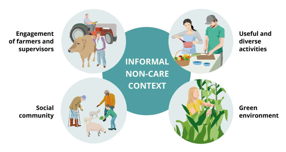
Figure 1: Key qualities of social farms